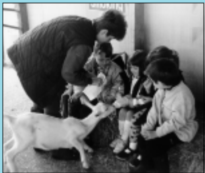
A party of infants at Stockley Farm on one of the many school visits taken over the year.

Eighteen Silver and twelve Gold level candidates successfully completed their expeditions and explorations in the Lake District at the start of July. This follows on from the twenty-four Bronze candidates who endured a midge-ridden night to complete their expeditions in June.