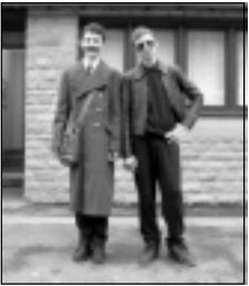
Comic Relief Day

Charities Week raised over £4000 to support eleven different charities.