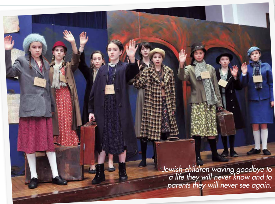
Jewish children waving goodbye to a life they will never know and to parents they will never see again.